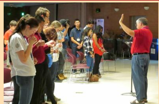
St. Helen Parish Glendale Teens and young adults listened to speakers and gathered into share